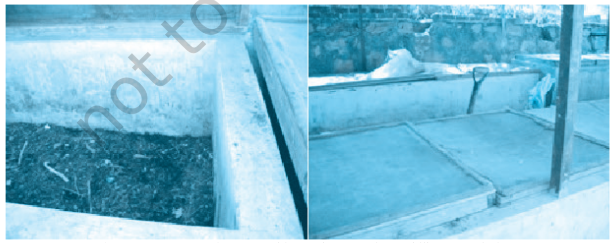
Fig. 10.5 Compost Pit prepared by Bethany Society, Shillong, Meghalaya

Often you may have come across persons (the Kabariwalas ) who visit our home, and to whom we sell old newspapers, magazines, bottles, tins, etc. Maybe, you have never thought where these products go, and what happens to them. These products are utilised as raw materials for manufacturing other products. In other words, these products are recycled . This is actually an important effort, as in this process, we not only reduce the load of garbage, but also conserve natural resources. Some of the common items that can be recycled are