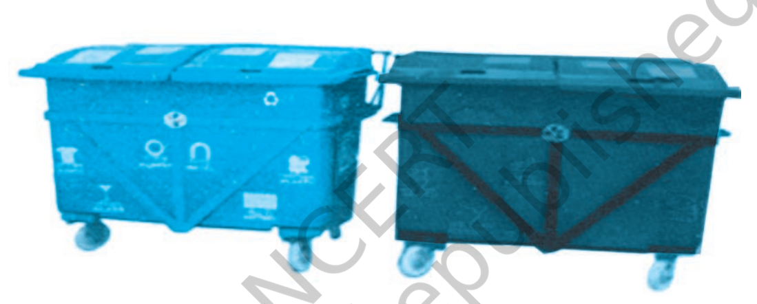
Fig. 10.4: Blue and Green Bins

(a) Wet waste, (b) dry waste, (c) hazardous waste.