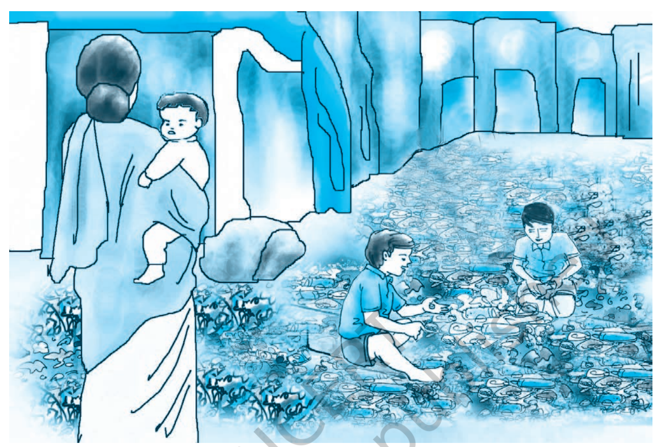
Fig. 10.3: Children playing with waste material

Through this activity you will be surprised to find that many of the items that have been discarded by you, still have utility. On the other hand, there are certain wastes, such as wet waste (kitchen waste), which can be reduced to almost 'zero waste'. Let us now discuss how we can reduce the volume of solid waste and garbage, by practising waste management and segregation through the principles of "reuse, recycle, reduce and refuse."