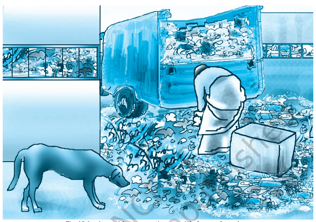
Fig. 10.1 : A rag picker segregating materials from garbage dump

However, with the enormous volume of waste that is being generated now-a-days, the concerned authorities are finding it difficult to deal with this problem. Most often we find that all sorts of solid wastes are dumped together in the landfills, which in many places, have already overreached its accumulation level. Moreover, groundwater in the immediate vicinity of such landfill sites is prone to contamination through continuous contact with the deposited waste. (Details of the structure of landfills have already been given in the Science textbook of Class VI).